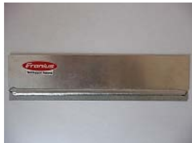
Fig. 4 Sample of weld by Fronius

Figure 3 shows an example of several samples that it was set different welding parameters. The sample weld 3 is satisfactory. Connection of materials is continuous with no obvious external defects. Sample 7 is visually unsatisfactory. It was used in SynchroPuls mode – completely unsuitable for joining these materials. Aluminum sheet is not continuously connected with galvanized steel. This weld has many external defects. Nice weld is evident in a sample of 10, there mode is selected CMT with oscillating torch. In the middle of the weld was faulty connection. It was a slight defect. For comparison, Figure 4 is a sample specimen CMT weld directly from Fronius.