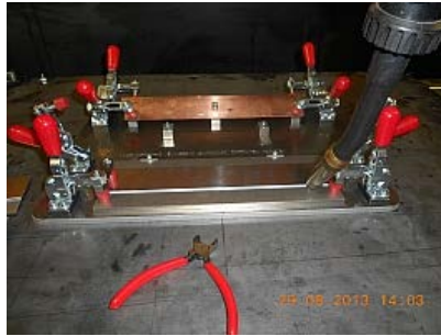
Fig. 2 Preparation for fastening welded materials