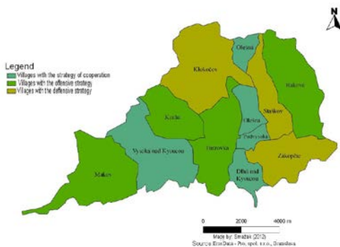
Picture 1 Division of the villages based on the SWOT analysis

Villages in this category have a big recreation potential especially in terms of natural capacity. They are at the beginning of the process of tourism development since realization prerequisites for such development have not been created there. Therefore, at this stage, it is very important for them to cooperate with other villages of the region. Villages in this category: Vysoká nad Kysucou, Dlhá nad Kysucou, Podvysoká and Olešná.