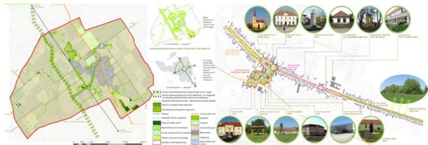
Fig. 2. Green Infrastructure of the cadastral area and the central part of the rural settlement

A more detailed GI concept has been elaborated for the cadastral area of the rural settlement Tvrdšovce. Its main goal is to define and improve linkages between the urban area and the open land. At the central part of the town, there is a public space design concept for the historic streetscape and the town centre, see fig. 2.