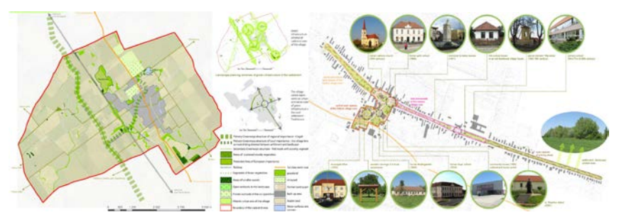
Fig. 2. Green Infrastructure of the cadastral area and the central part of the rural settlement

A more detailed GI concept has been elaborated for the cadastral area of the rural settlement Tvrdošovce. Its main goal is to define and improve linkages between the urban area and the open land. At the central part of the town, there is a public space design concept for the historic streetscape and the town centre, see fig. 2.